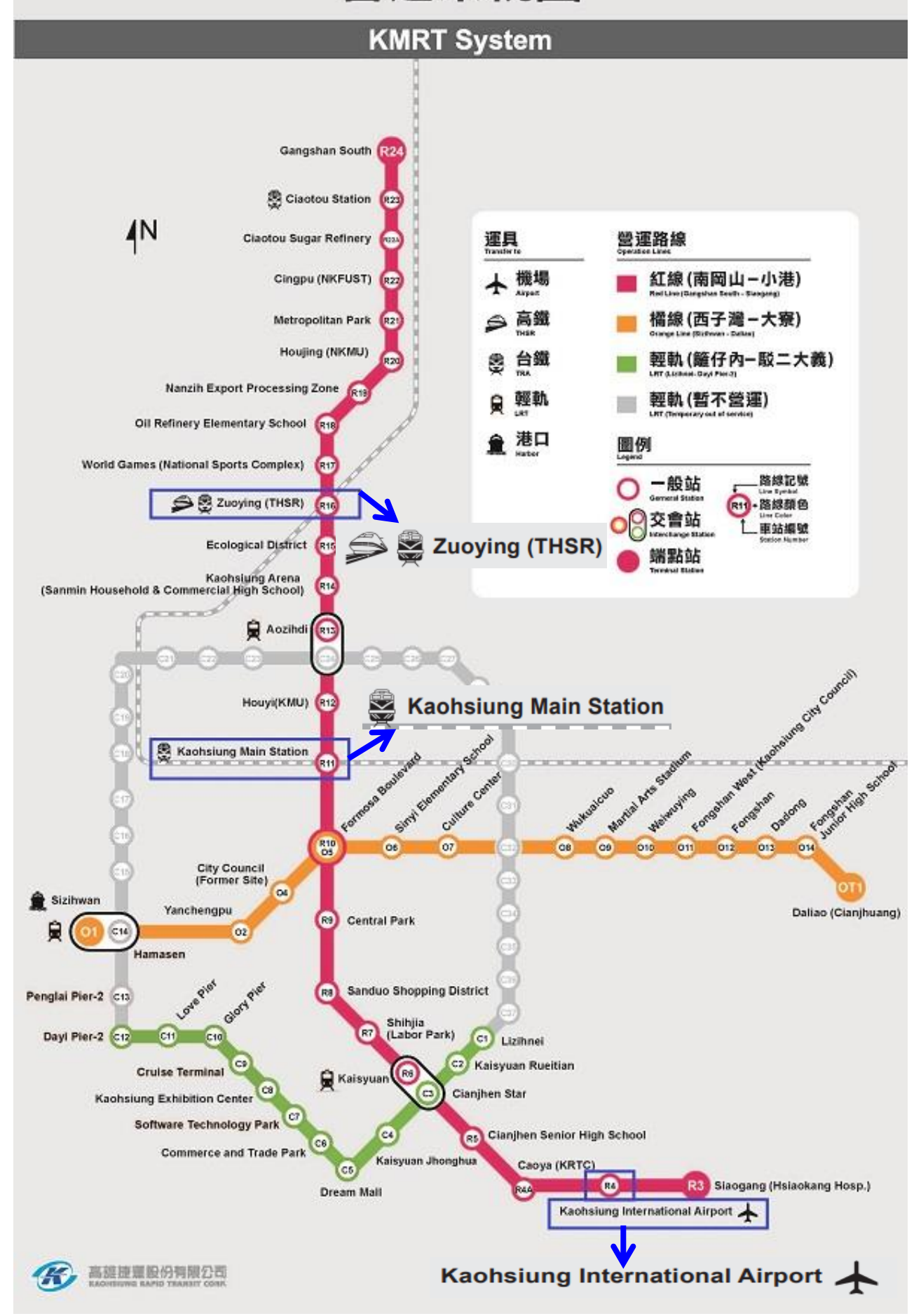
Fig. 1: KMRT System